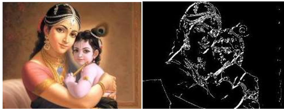
Fig .1 Original Image

Edge detection is the concept for a set of mathematical methods whose aim is to identify the points in a digital image at which the image brightness changes sharply or, more formally, has discontinuities. Edges typically occur on the boundary between 2 regions[2]. Edge is defined as the boundary pixels that connect two separate regions[3] with changing image amplitude attributes such as different constant luminance and tristimulus values in an image. Edge detection is a well developed field on its own within image processing. The main features can be extracted from the edges of an image which significantly reduce the amount of data to be processed while preserving the important structural properties of an image[1]. The example of an original image and image after edge detection are shown in Fig. 1 and Fig. 2 respectively below.